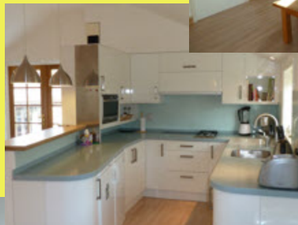
View from lounge & bedroom