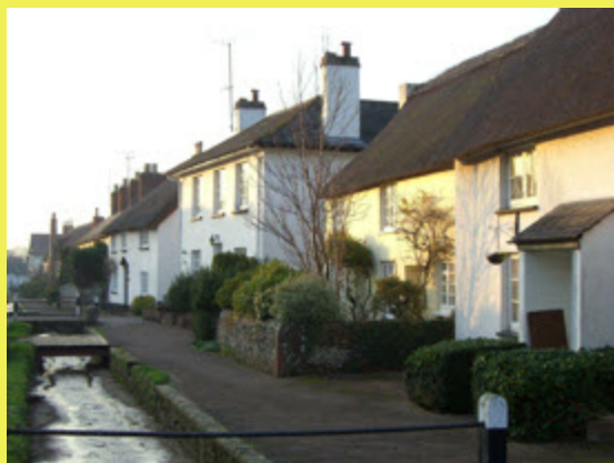
Thatched cottages and brook in the centre of Otterton