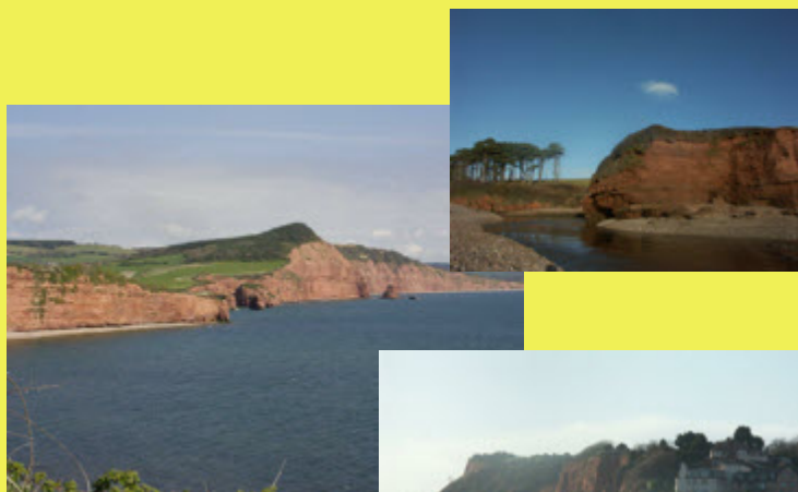
Views of the red cliffs along the nearby coast