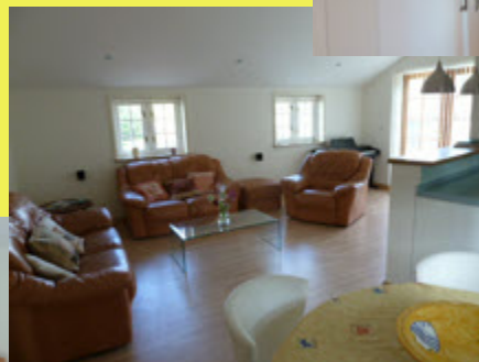
View from lounge & bedroom