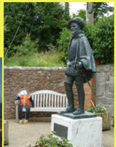
Sir Walter Raleigh statue in East Budleigh