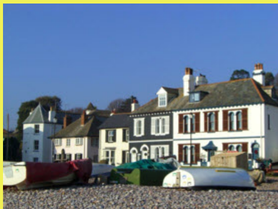
Houses overlooking the sea at nearby Budleigh Salterton

There are many varied lovely walks, for instance along the nearby coastal cliffs, along the river Otter and on Woodbury Common. One mile from the 'Barnhuis' lies Ladram Bay which has full holiday resort facilities. Just a few of the many sites of interest in the area are Otterton Mill, mentioned in the Domesday book, the Jurassic Coast World Heritage Site, Bicton Park, the sandy beaches at Exmouth, Exeter Cathedral and about an hour away are Dartmoor and Exmoor. There is so much to do and see in this area.