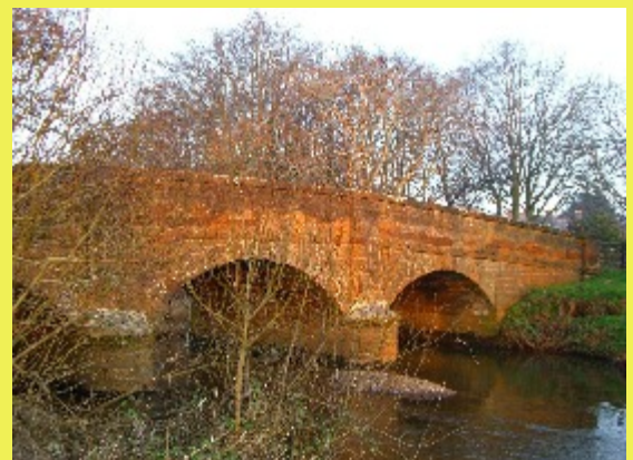
The bridge over the R. Otter, leading in to Otterton village