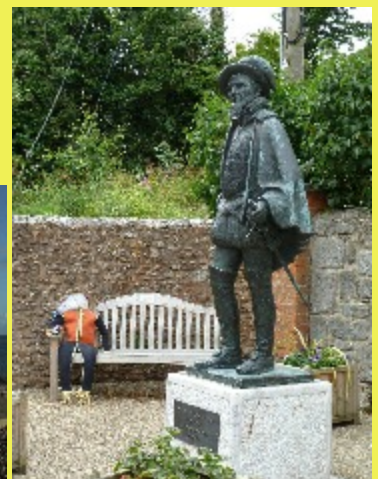
Sir Walter Raleigh statue in East Budleigh