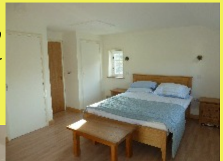
View from lounge & bedroom