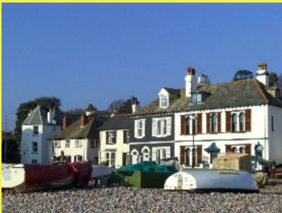
Houses overlooking the sea at nearby Budleigh Salterton

There are many varied lovely walks, for instance along the nearby coastal cliffs, along the river Otter and on Woodbury Common. One mile from the 'Barnhuis' lies Ladram Bay which has full holiday resort facilities. Just a few of the many sites of interest in the area are Otterton Mill, mentioned in the Domesday book, the Jurassic Coast World Heritage Site, Bicton Park, the sandy beaches at Exmouth, Exeter Cathedral and about an hour away are Dartmoor and Exmoor. There is so much to do and see in this area.