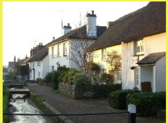
Thatched cottages and brook in the centre of Otterton